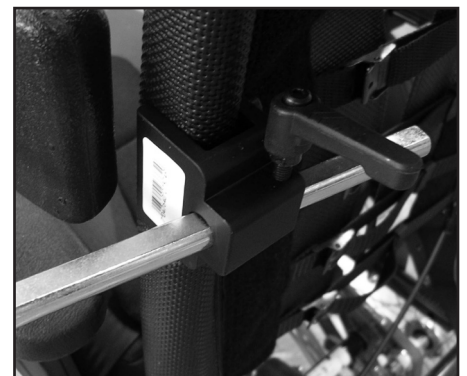
Netti I, II, III, Svipp, 4U CED

NB! When Side Support Correction is used on the Netti models, we recommend to use the Flip backrest cushion.